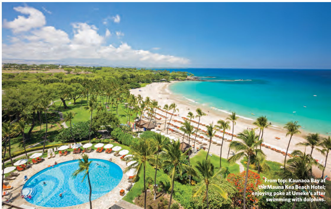
From top: Kaunaoa Bay at the Mauna Kea Beach Hotel; enjoying poke at Umeke's after swimming with dolphins.