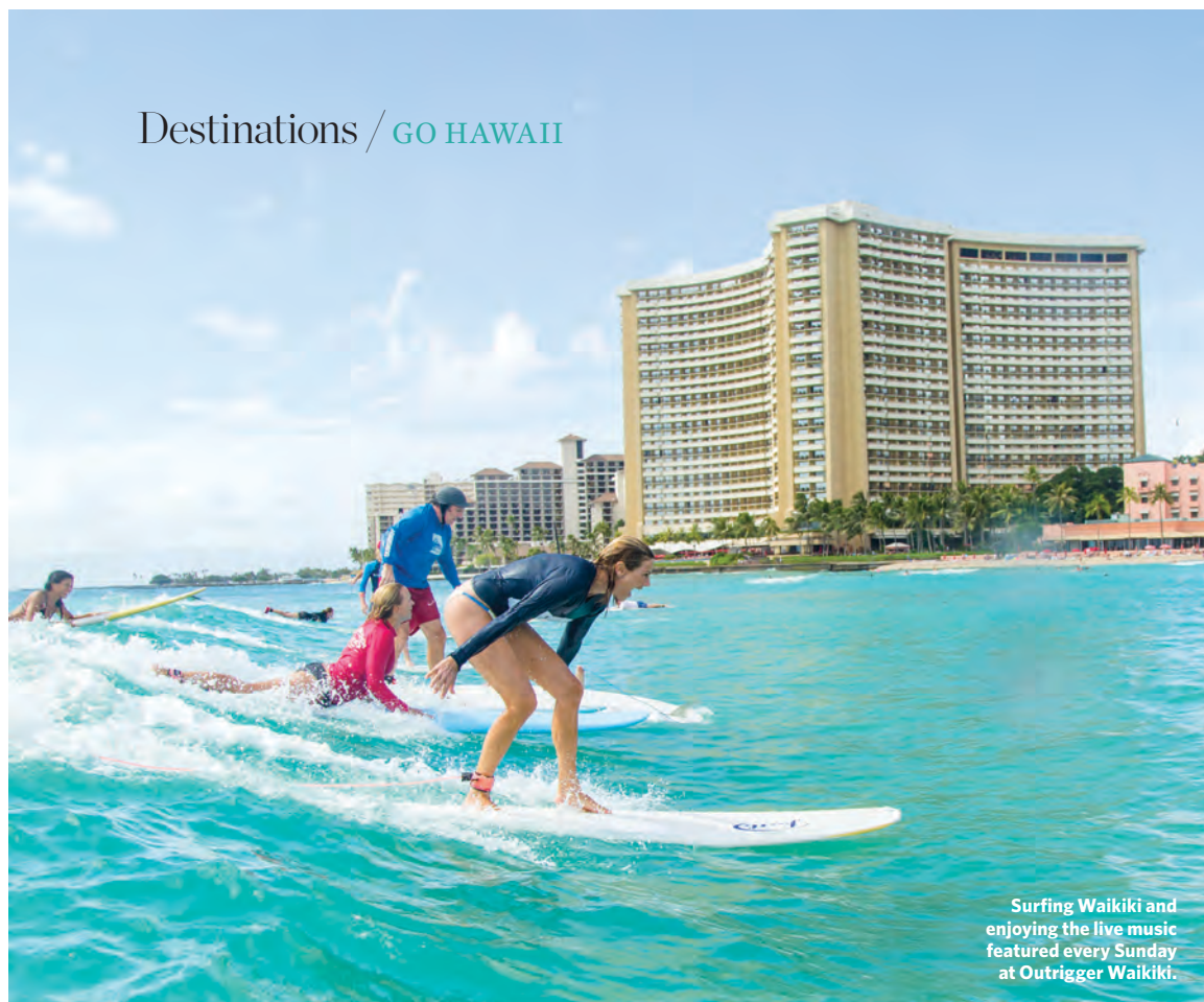
Surfing Waikiki and enjoying the live music featured every Sunday at Outrigger Waikiki.